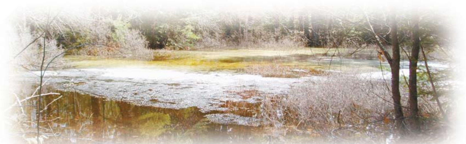
Vernal pool with ice

Significant Wildlife Habitat is an area protected under Maine's Natural Resources Protection Act. The Maine Department of Environmental Protection (DEP) has established criteria to identify significant vernal pools, those with the highest value to wildlife. While forest management is exempt, other development activity within 250 feet of significant vernal pools may require a permit from DEP. The permit review process helps assure that any activities in and around significant vernal pools are done in ways that avoid harm to both wildlife and habitat.