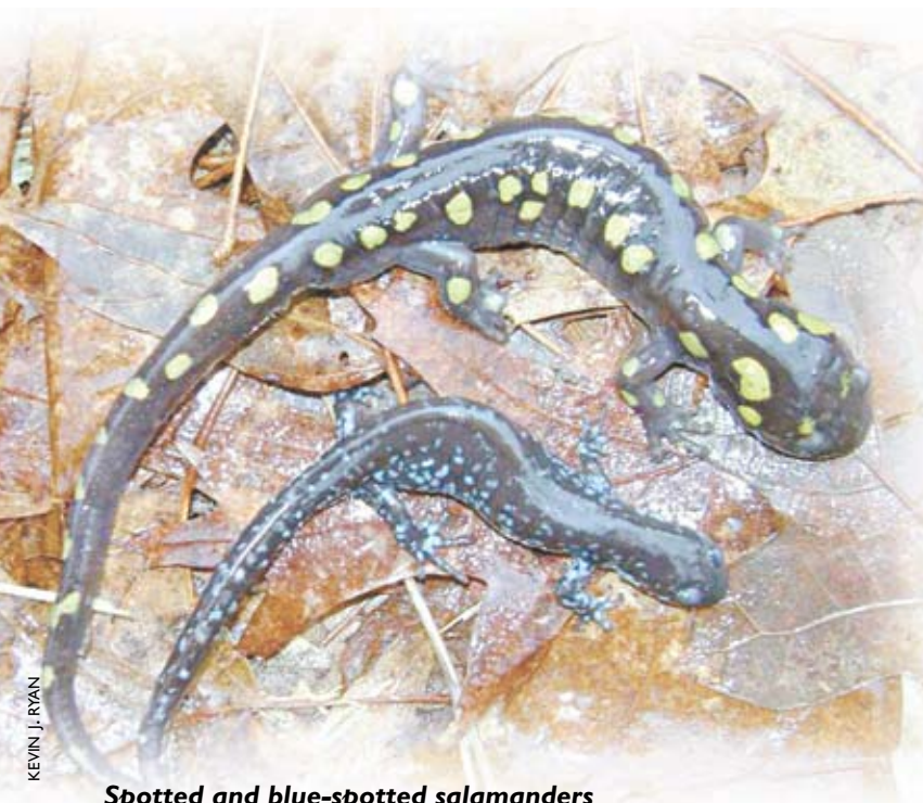
KEVIN J. RYAN

The forested uplands surrounding vernal pools are critically important for the survival of vernal pool amphibians. Pool-breeding species travel from the pools to forested and other wetland habitat where they can find abundant food, safety from predators, and places to hibernate. A vernal pool in isolation from these other important habitats will not sustain its amphibian population. To maintain healthy populations of vernal pool wildlife, it is important to maintain relatively undisturbed forest adjacent to pools. It is also important to maintain corridors of habitat among clusters of vernal pools, since amphibians and turtles may use multiple pools as stepping stones on their way to and from other habitats.