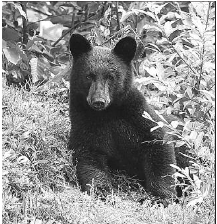
Black Bear relaxing at the meadow's edge