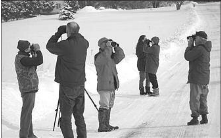
Binoculars aid last year's participants of the Big Fields road trip