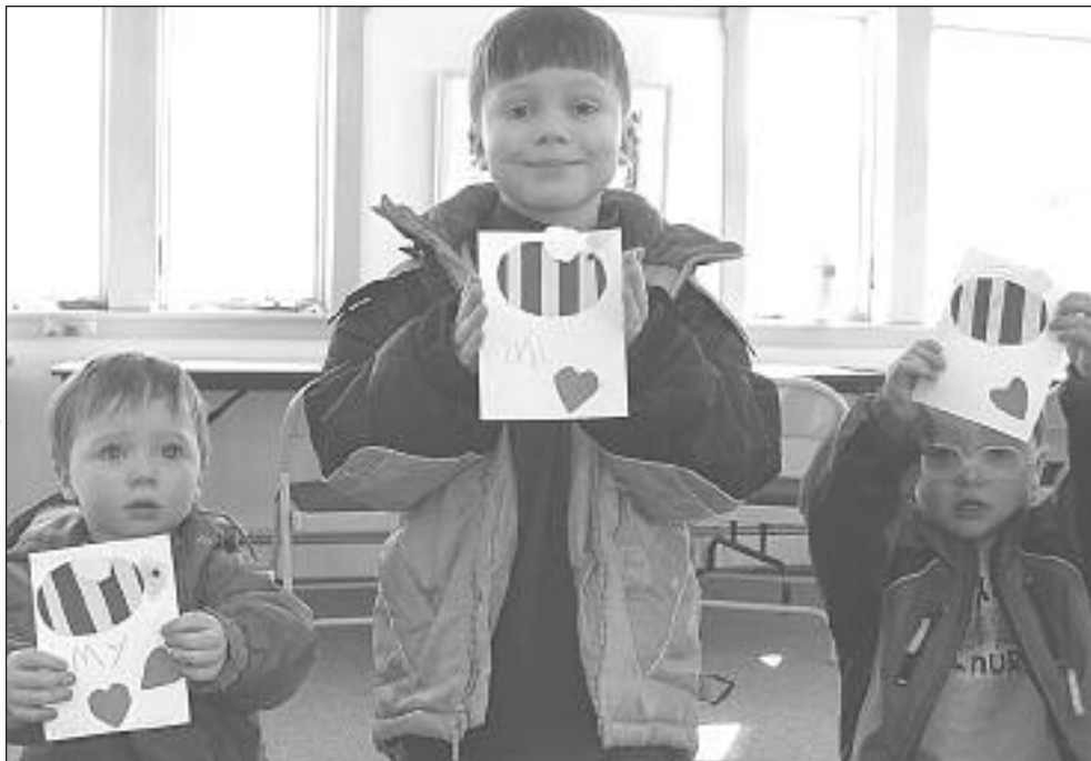
Nature Time participants made Bee My Valentine cards at Fields Pond Audubon Center

Signs of Spring training: Tuesday, February 24; Thursday, February 26; Wednesday, March 4; Friday, March 6.