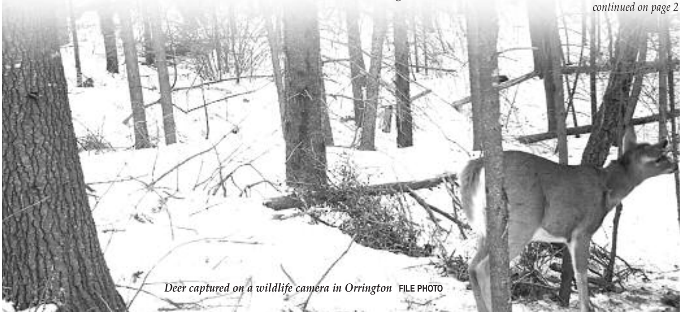
Deer captured on a wildlife camera in Orrington FILE PHOTO