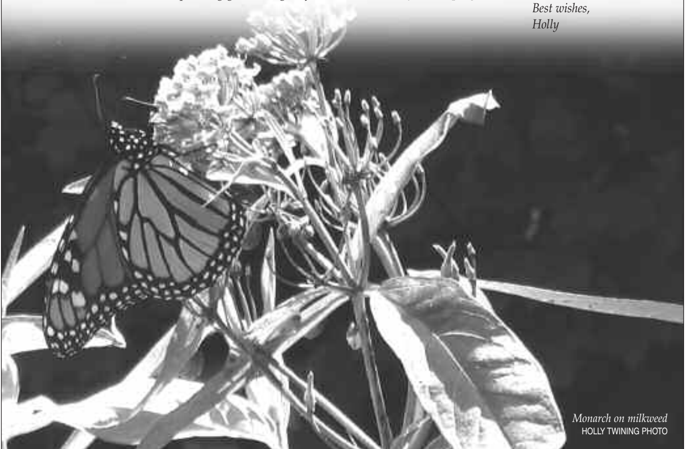
Monarch on milkweed