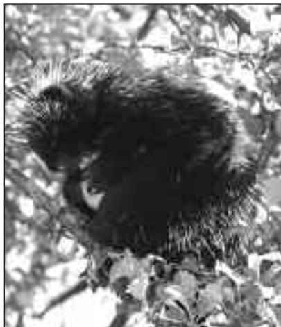
Porcupine in the FPAC apple tree