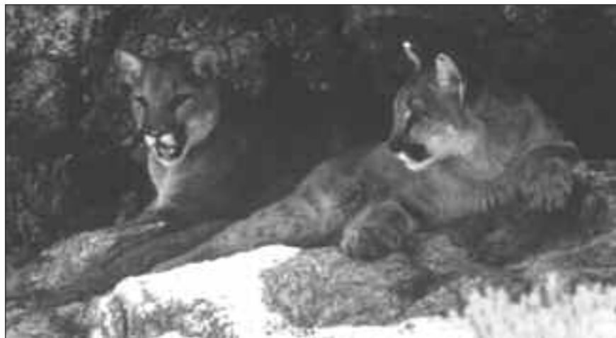
Cougars in Maine?