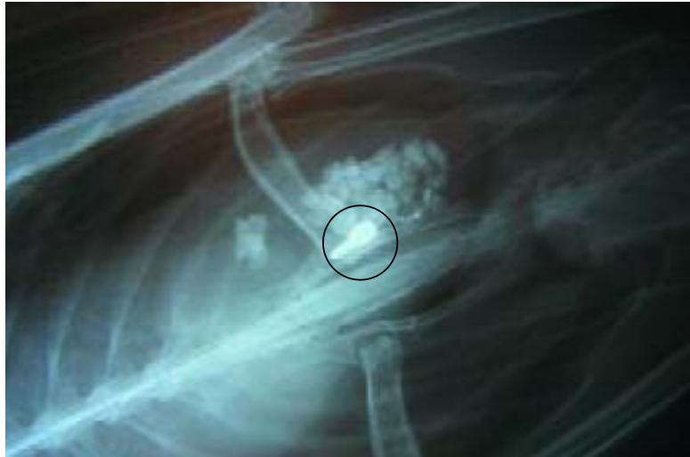
Poisoning from a lead sinker (circled) killed this loon from Long Pond on Mount Desert Island. Lead poisoning is the leading known cause of death of Maine's loons.